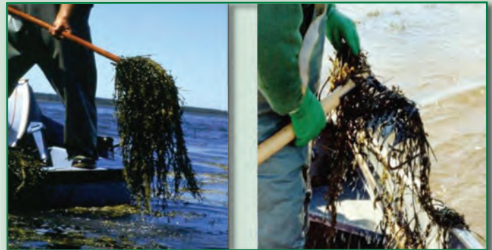
Harvesting Ascophyllum Nodosum in the Bay of Fundy